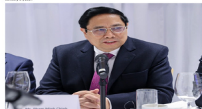
HCMC - Vietnam Prime Minister Pham Minh Chinh, speaking at the World Economic Forum (WEF) in Davos, has called for companies from developed economies to invest in Vietnam. During his 45-minute address at the WEF on January 16, PM Chinh highlighted collaborative initiatives in the fields of artificial...